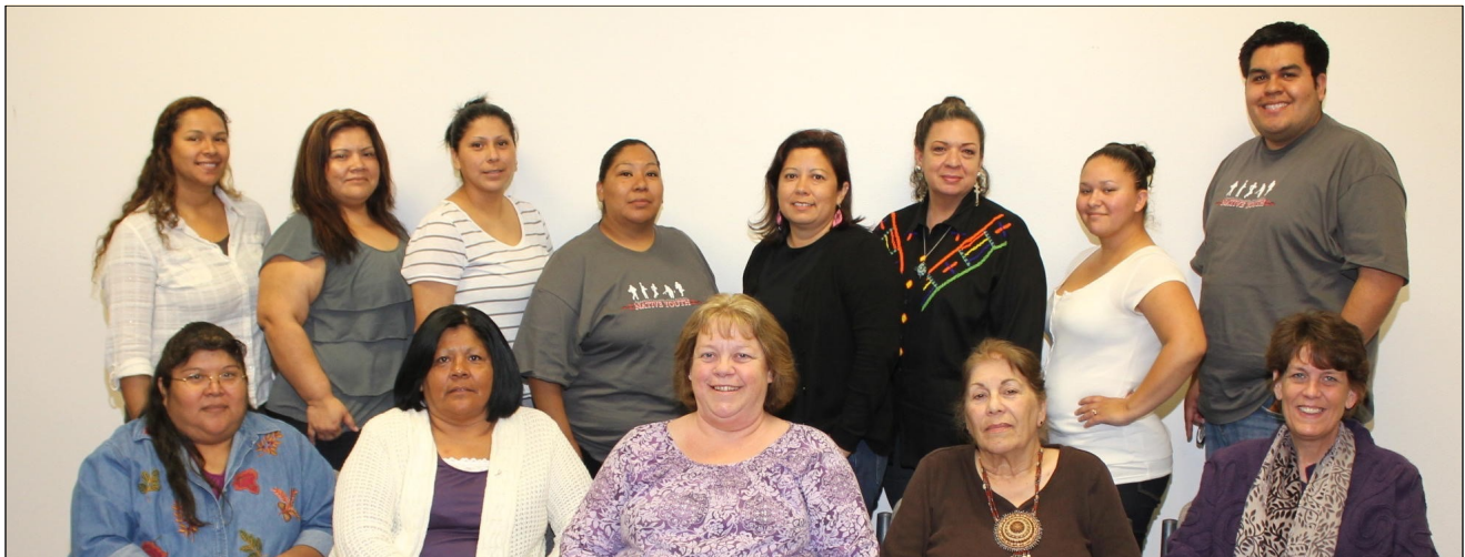
Native Women's Wellness Council

Northern Valley Indian Health (NVIH) is a non-profit Tribal Corporation that was founded in 1971 by a group of Northern California Native American Tribes seeking to re-establish health services for American Indians in Northern California. NVIH currently operates clinics in Chico, Willows, Woodland, and Red Bluff, California while also maintaining a Children's Health Center and Mobile Dental Clinic. The consortium of tribes currently includes: Mechoopda Indian Tribe of Chico Rancheria, Grindstone Indian Rancheria of Wintun-Wailaki Indians of California, Yocha Dehe Wintun Nation of California, and the Cortina Band of Wintun Indians of California.